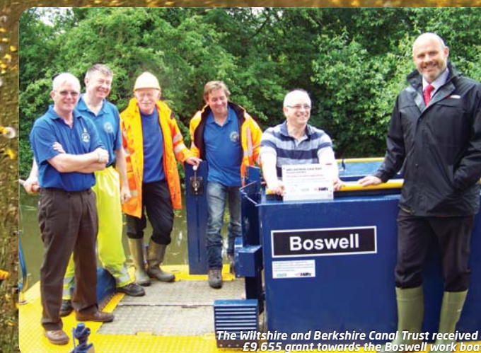
The Wiltshire and Berkshire Canal Trust received a £9,655 grant towards the Boswell work boat.

A stylish brochure has been produced to celebrate the unique 25 year partnership between The Hills Group and Wiltshire Wildlife Trust (WWT).