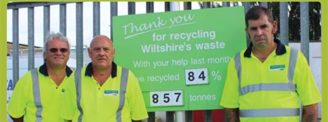
% of waste recycled between February 2016 to end of June 2016