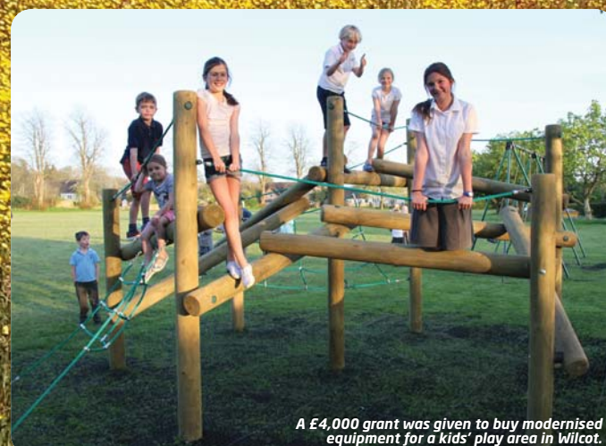
A £4,000 grant was given to buy modernised equipment for a kids' play area in Wilcot.