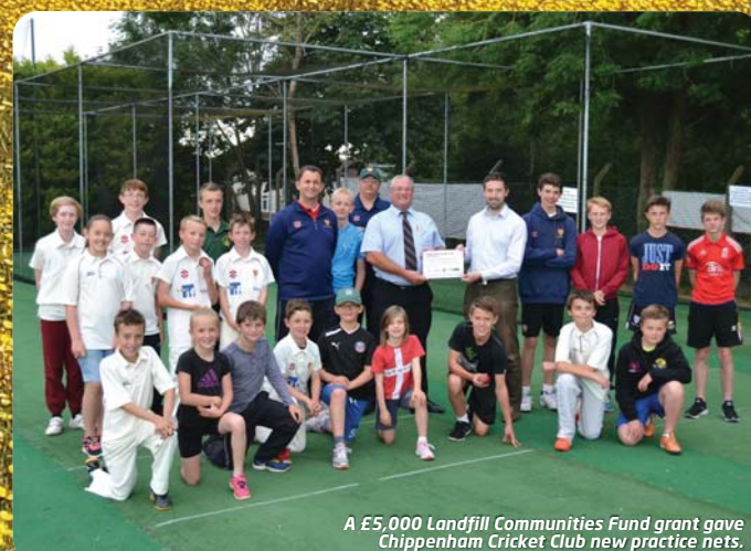
A £5,000 Landfill Communities Fund grant gave Chippenham Cricket Club new practice nets.