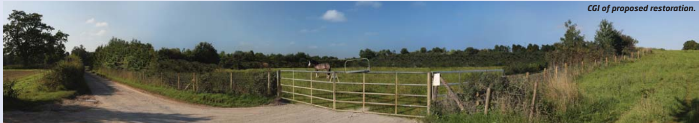
CGI of proposed restoration.

shown below) and the other area of the site will be re-profiled and restored to grass ley with potential for a bee habitat. New hedges will be planted across the site and will include a mix of Hawthorn, Blackthorn, Hazel, Field Maple and other species.