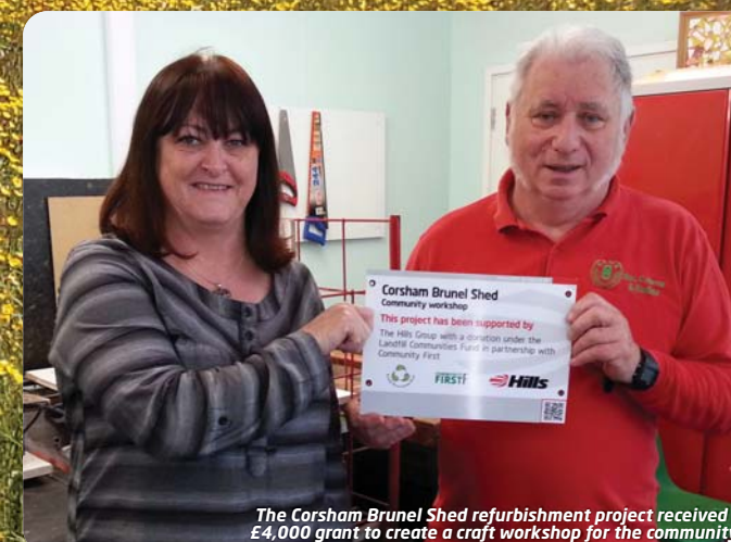
The Corsham Brunel Shed refurbishment project received a £4,000 grant to create a craft workshop for the community.