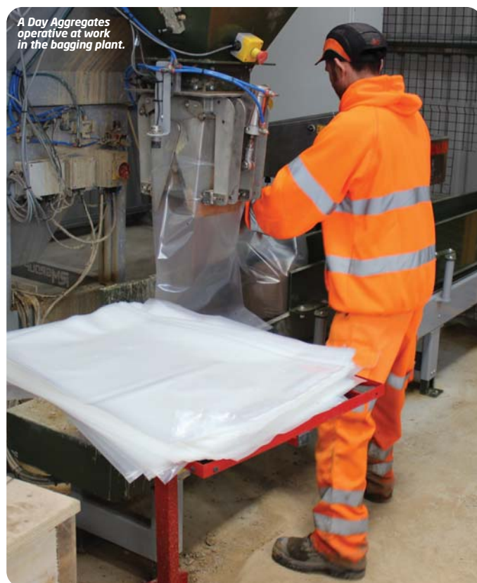
A Day Aggregates operative at work in the bagging plant.