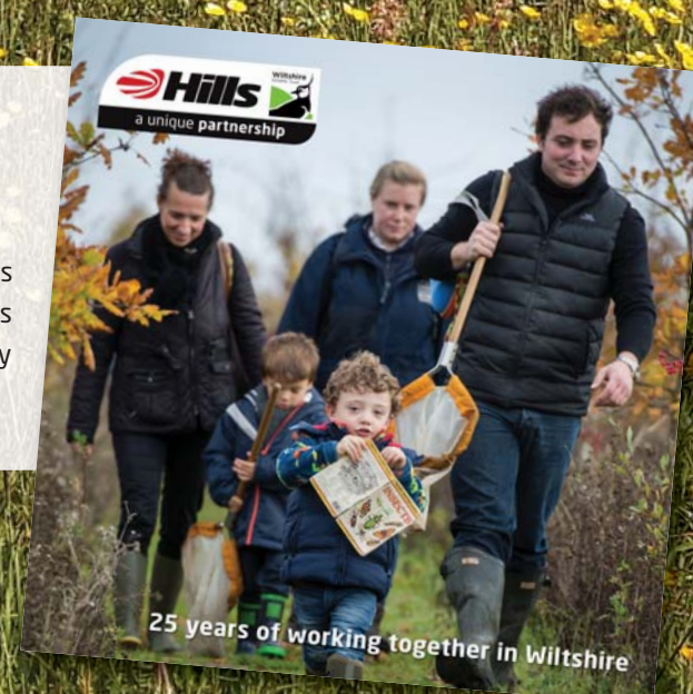
A £10,000 donation was made to Jones's Mill, a Wiltshire Wildlife Trust project to help to protect and improve diverse habitats. Jones's Mill