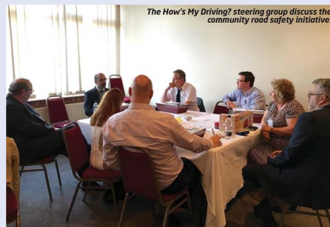
The How's My Driving? steering group discuss the community road safety initiative.

youth group wants to film an awareness video - invite them to take advantage of this opportunity. More details on how to apply for a grant can be obtained from info@howsmy.co.uk