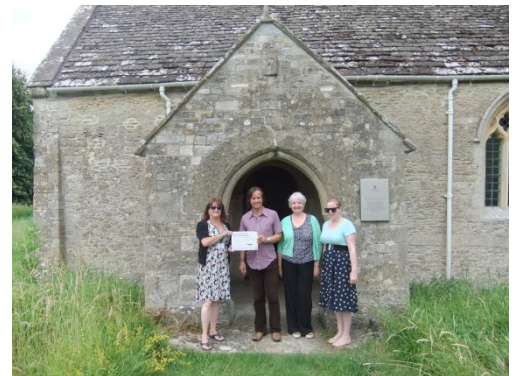
Shorncliffe All Saints received £5,000 towards a new roof