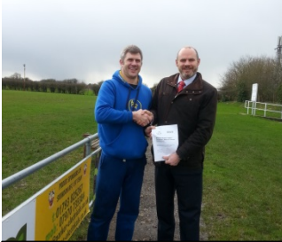
Swindon RFC received £15,000 to install a new boiler in the changing rooms

Figures released by The Hills Group show that projects which received funding included 13 community and environmental projects, 5 kids play areas, 15 sports facilities and 12 village and community halls. The projects stretch across the length and breadth of the county with grants ranging from £3,000 up to £30,000.