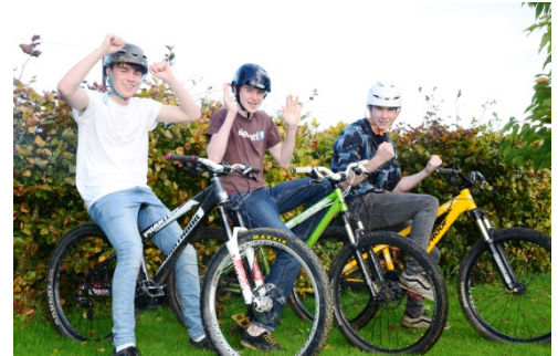
Bromham Village received £10,000 for their BMX bike track

Wiltshire Wildlife Trust, Community First and the Cotswold Water Park Trust to distribute the funds as widely as possible.”