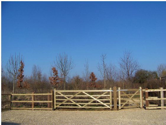
Image 2: The entrance gate to the woodlands with car park in foreground