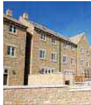
The Light, in Bristol Street, is a development of just 10 houses that have been built in a traditional style reflecting the town's historic beauty; stone built, they capture the essence of period style