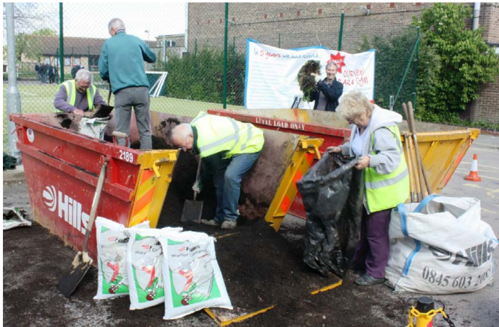
Cricklade residents drop off green waste and collect compost.

Residents of Cricklade were invited to ‘bring a bag and fill it with compost’ at the Cricklade Leisure Centre on Saturday 12 May from 8.00am.