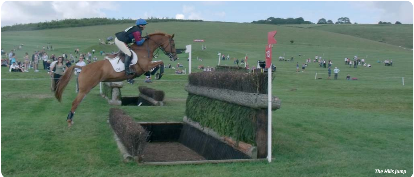
The Hills Jump

Employees from both divisions actively engaged with members of the public over the two days promoting the services that they provide.