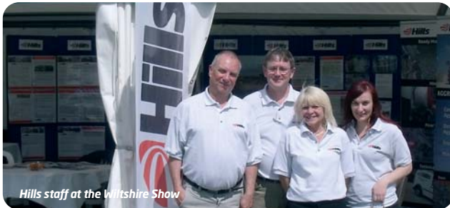
Hills staff at the Wiltshire Show