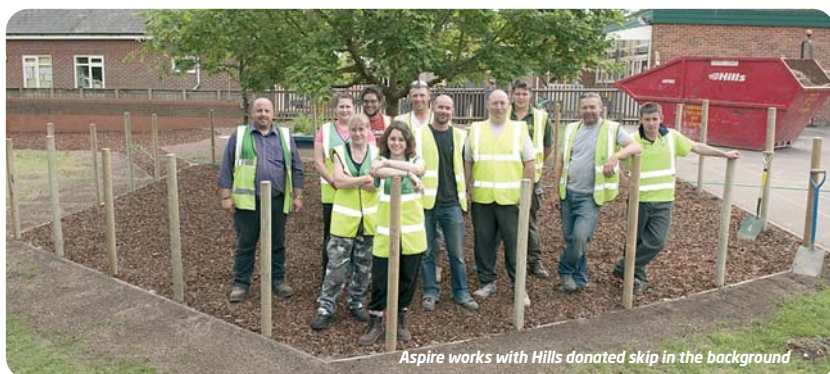
Aspire works with Hills donated skip in the background

Voluntary Playground works at Shipton Bellinger Primary School.