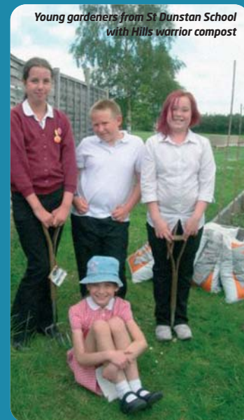
Young gardeners from St Dunstan School with Hills warrior compost

Potatoes, tomatoes, courgettes, pumpkins and sunflowers had a growth spurt after compost was added to the thick clay soil.