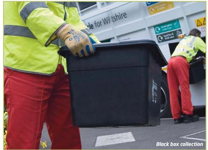
Black box collection

"I phoned Hills because I was very frustrated about the fact that my black bin had not been emptied again! After putting my point