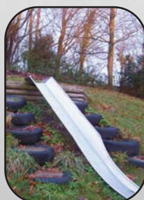
Play areas benefit from Hills' funding - page 7