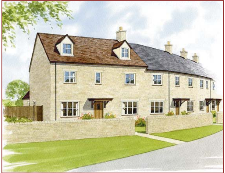
Artists impression of Ascott-under-Wychwood homes

Close to the centre of the village, Homes is building five 4 and 5 bedroom properties. Using the finest traditional materials to ensure they fit seamlessly into the landscape, these substantial homes offer an opportunity to enjoy the best of both worlds - a home built to reflect modern tastes and lifestyles, in a peaceful yet thriving rural setting. Four of the homes offer additional paddock space in addition to good sized gardens. Marketing is due to commence in Spring 2011 with expected guide prices from £695,000.