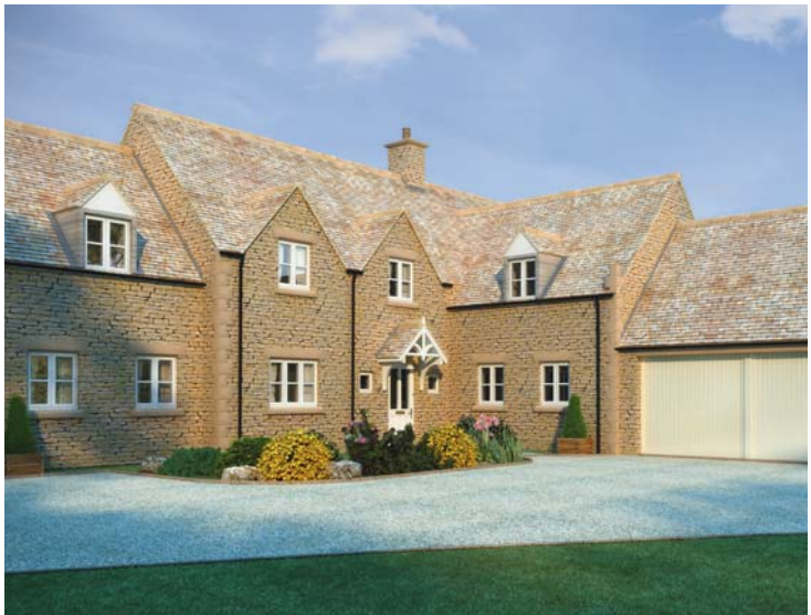
One of the properties at Southrop