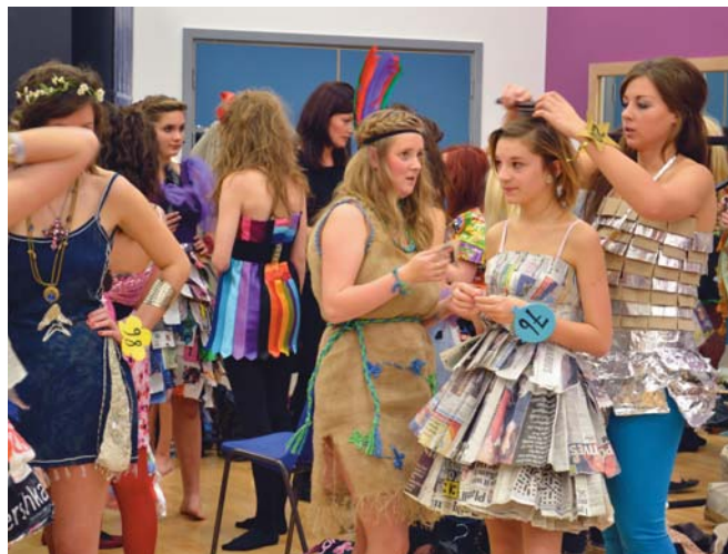
Designers put the finishing touches to their outfits