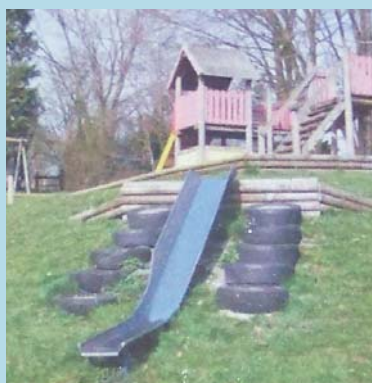
The old play equipment which has now been removed

Two important community play areas received grants from the Hills Group, via the Landfill Communities Fund to provide new play areas for local children and young people.