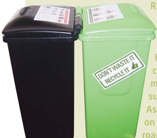
The new twinbin