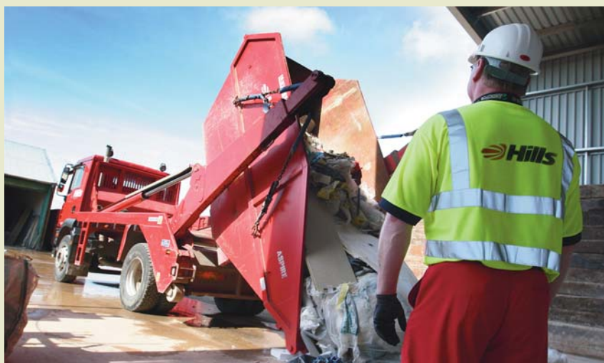
Waste Transfer Station at Tidworth