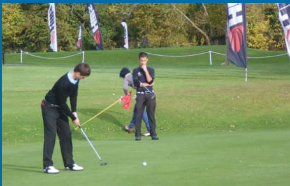
Putting on the green