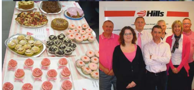
Employees in their pink outfits in aid of Breast Cancer Awareness raising a total of £315 on the day