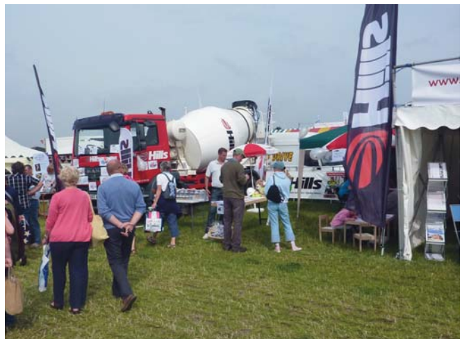
Quarry Products' stand at the Dorset Show