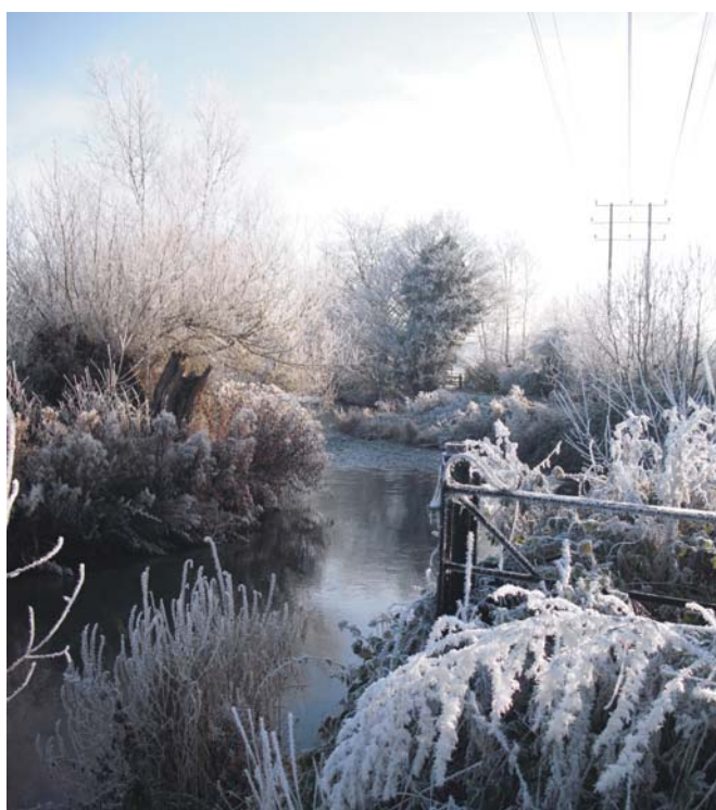
River at Witney on a frosty morning