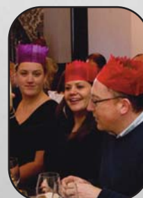
Staff enjoy the festive season - pages 16 and 17