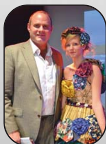
Trashion hits the catwalk - page 6