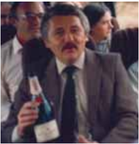
The early years

prepared in ledgers and on 14 column analysis pads (the manual forerunner of a spreadsheet). The first computer turned up around 1972, it took up a whole room and could only perform one task at a time and could probably do only about 1% of what my current laptop does.