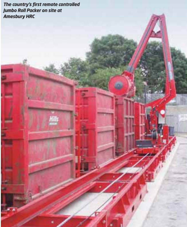
The country's first remote controlled Jumbo Roll Packer on site at Amesbury HRC

Equipment specialists Kenburn Waste Management have installed the country's first remote-controlled compaction system at Amesbury Household Recycling Centre.