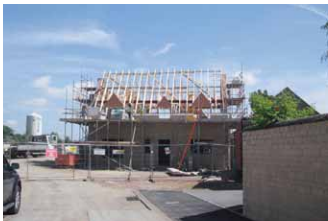
South Marston in progress

The construction of five substantial detached homes at St Julian's Close, South Marston, is now well underway.