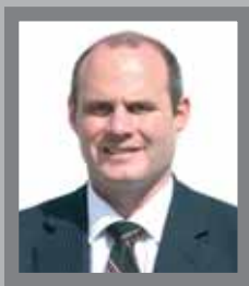
Michael Hill Group CEO