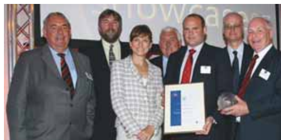
Receiving the QPA trophy in 2007 with TV presenter Fiona Bruce

I started in the accounts department, where in those days most things were done by hand; accounts were