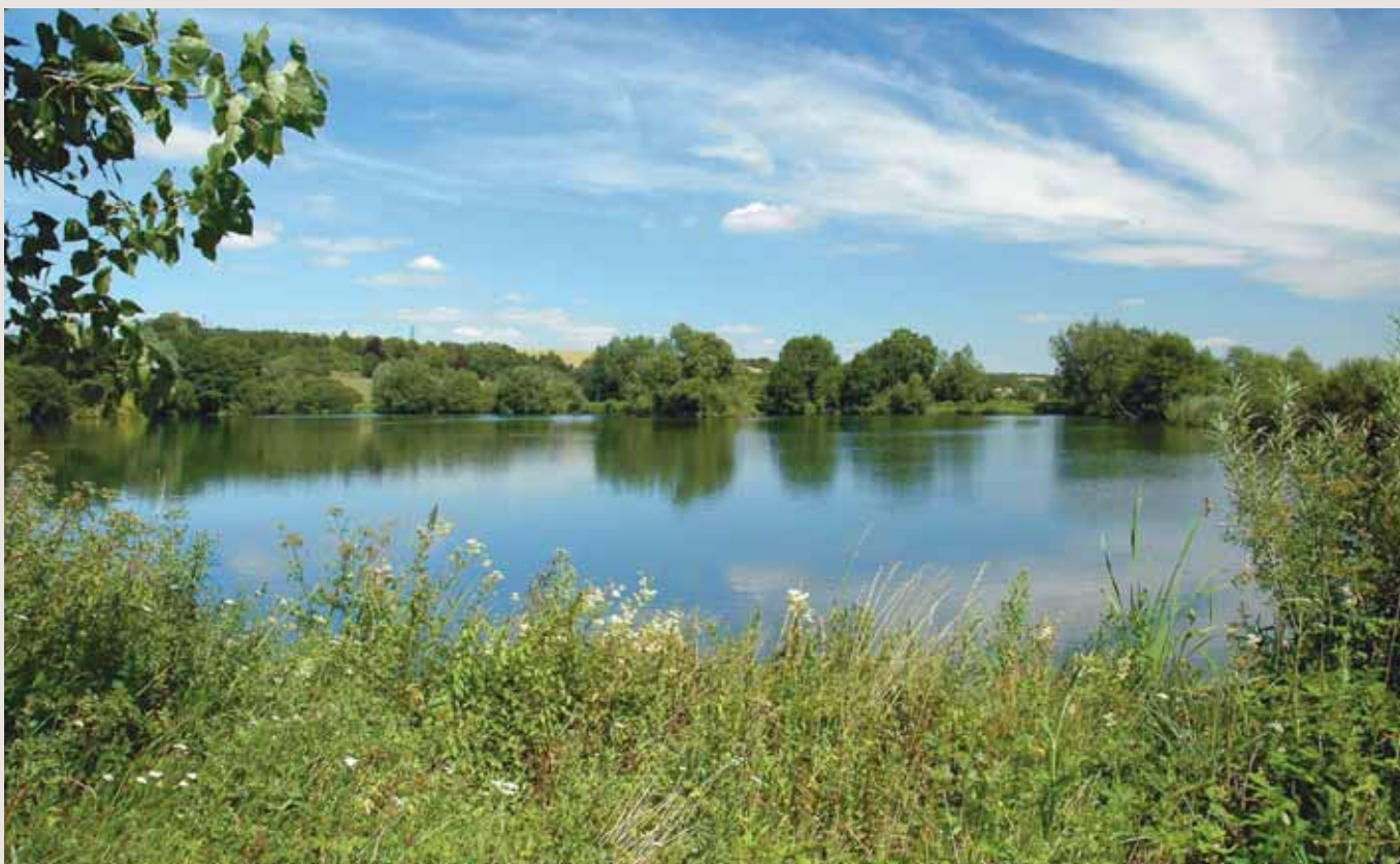
Hills wins national award for Langford Lakes

Hills Quarry Products will be looking at growing its network of ready-mixed concrete plants within the region and faces the