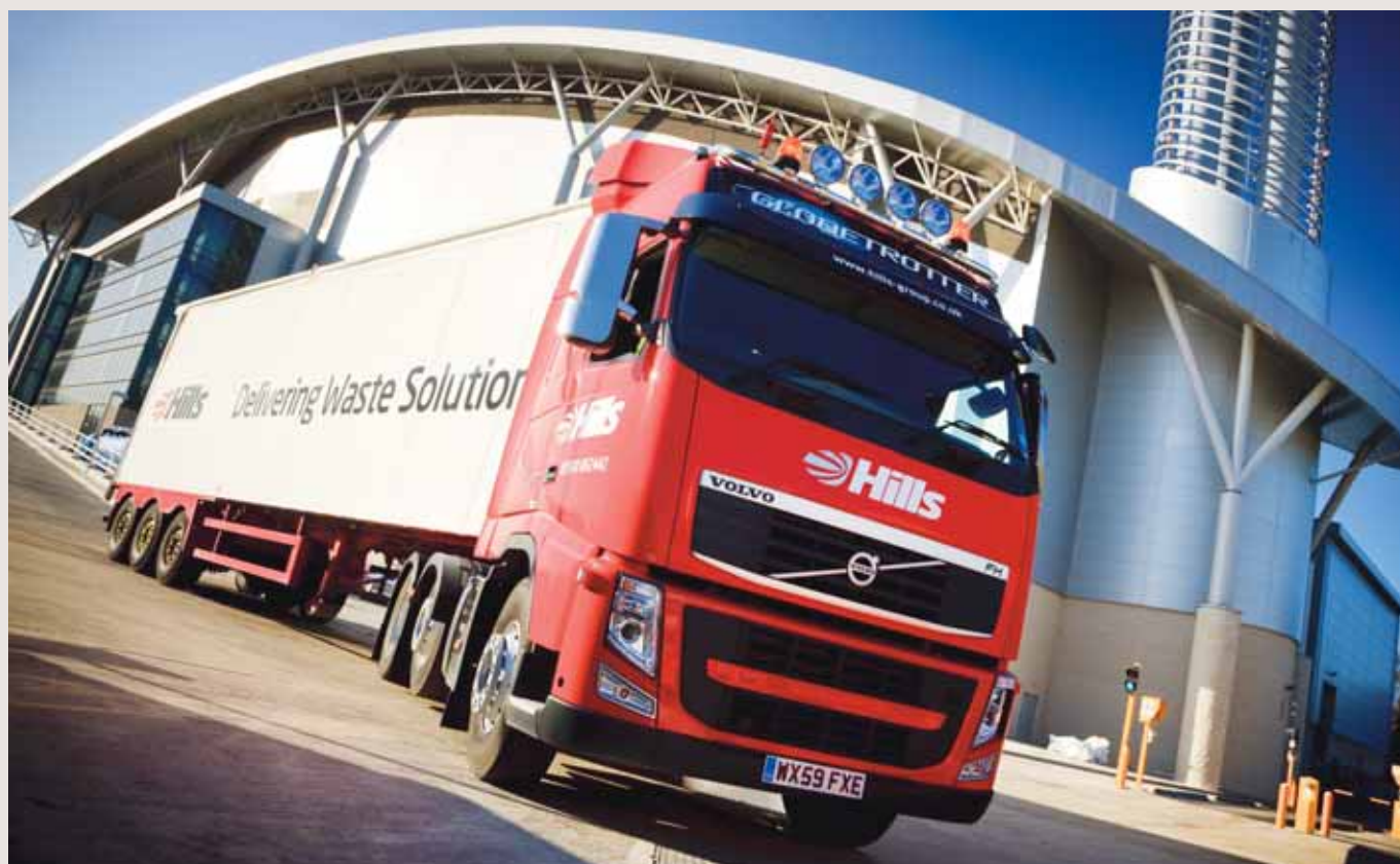
Artic lorry leaving the Lakeside EfW plant at Colnbrook

Recycling and waste management activities continue to grow for customers in both the public and private sectors. While hazardous and non-hazardous landfill remains an important activity, it is now a final option as Hills Waste Solutions seeks every opportunity to transform waste into a resource. In a typical year, it now recycles over 230,000 tonnes and harnesses sufficient gas from two landfill sites to satisfy the electricity needs of some 12,000 homes. Green waste is transformed into compost and wood is shredded into chips that help fire power stations.