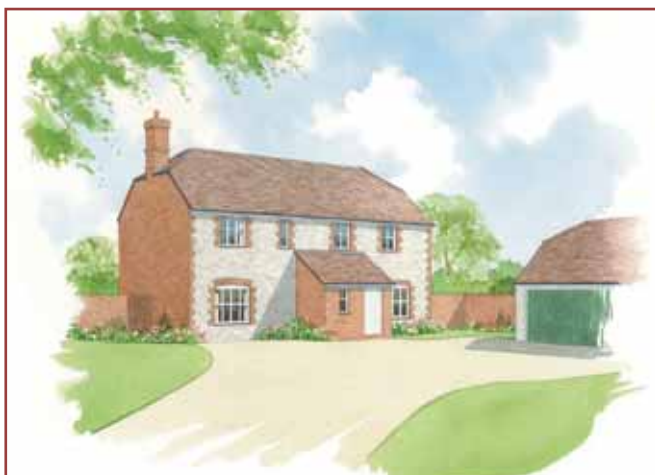
Artists Impression of Plot 4 at Idstone Road, Ashbury

With far reaching views across the valley to the front and pasture to the rear, these homes have proved so popular that they have all sold off plan. Built to Hills Homes' customary high standard the two semi detached cottages and two larger detached properties have been designed to sit naturally in their rural landscape and feature different architectural styles to echo the mix of properties in the village. Plots 3 and 4 each have a paddock in addition to their good sized gardens.