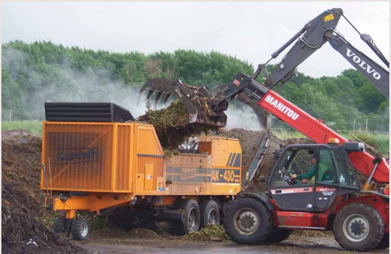
Doppstadt shredder being loaded with green waste for composting