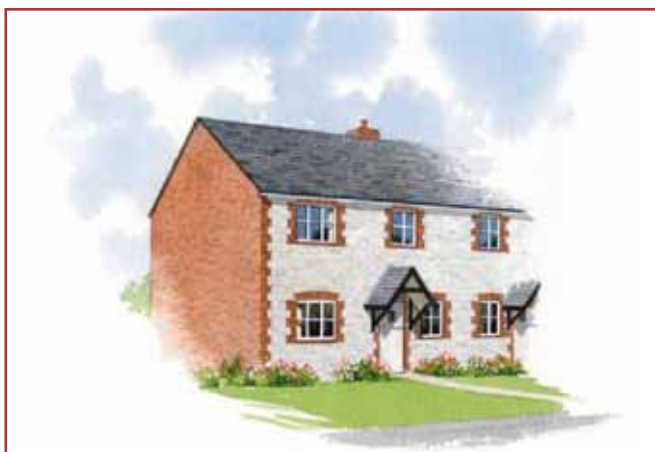
Artists Impression of Plot 1

The interiors will be no less impressive with well laid out living space and good sized bedrooms complemented by bathrooms from Villeroy & Boch. With many features to ensure low and sustainable energy usage, these new homes will be the period homes of the future.