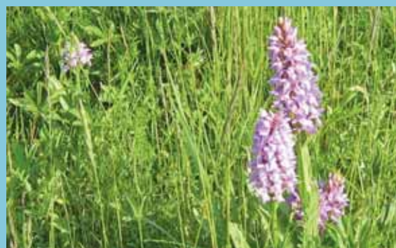
Southern Marsh Orchids growing at the High Penn site

Jubilee Gardens is a registered charity which provides education and training for adults with learning disabilities. The primary aim of the charity is to promote the development of horticultural skills, whilst maintaining growth in literacy, numeracy and social skills.