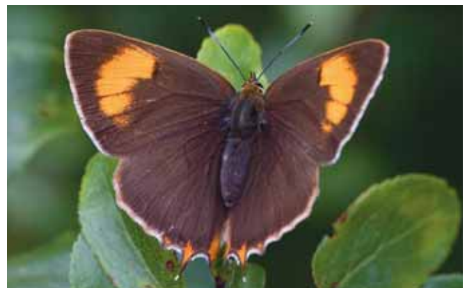
Brown hairstreak butterfly

Since 1996 Hills has contributed more than £4.5m to the Trust through the LCF to support the conservation of biodiversity and the provision of public amenities in the region.