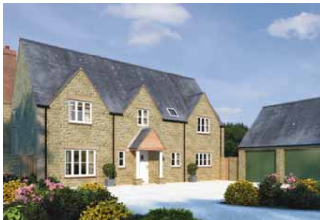
Computer generated image of Plot 6 St Julian's Close, South Marston

Marketing of the exclusive new homes is planned to commence this month.