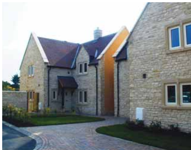
Section of the Castle Combe development that won the LABC award