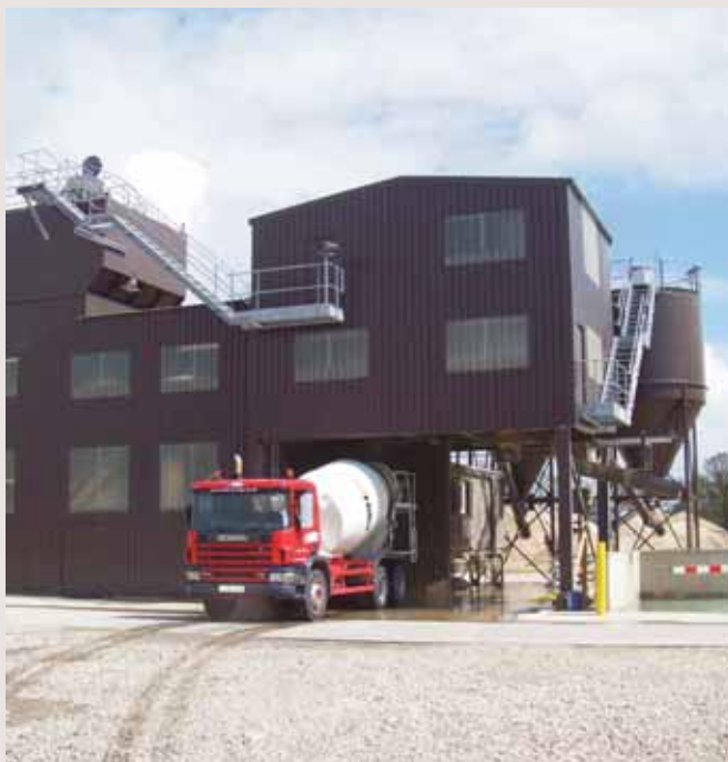
Concrete plant at Woodsford, Dorset

Hills Quarry Products operates five strategically located quarries serving wide areas of Wiltshire, Gloucestershire, Oxfordshire and Dorset. Facing potential loss of an important part of its market, the company launched its own ready-mixed concrete business in 2005. It now has three concrete plants, one of them at the new Woodsford Quarry near Dorchester where Hills took the opportunity to extend its boundaries with a valuable 4.2 million tonne reserve.