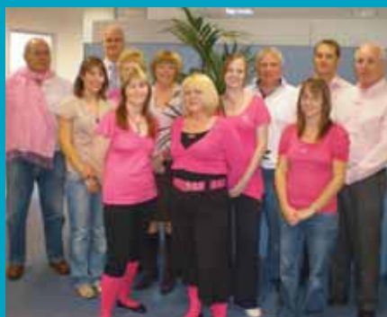
Pink ladies stand out at the Swindon Office

In addition to paying for the privilege of wearing an item of pink clothing, a cake sale and "guess the baby" competition were also held to raise funds.