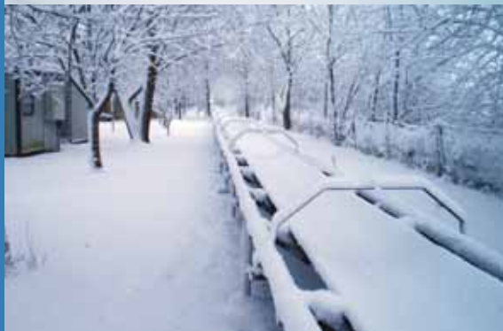
Snow on site at Shorncliffe