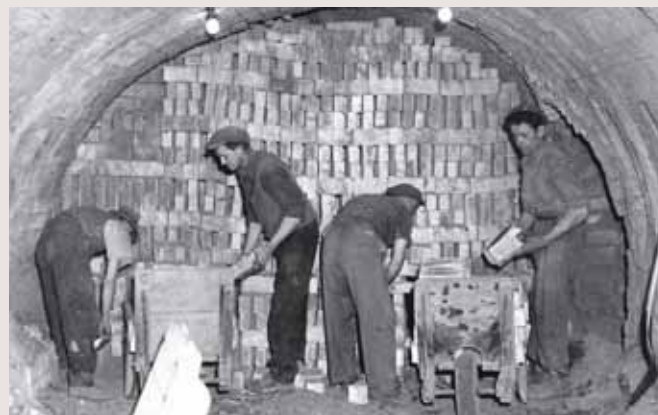
Stacking the continuous kiln at Purton