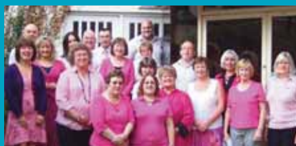
Staff wearing pink at Head Office