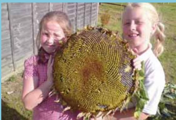
Pupils with the winning sunflower

The allotment garden has also been a success and has been supplying the school kitchen with items like onions, beetroot and strawberries with the children taking the rest of the produce home to eat.