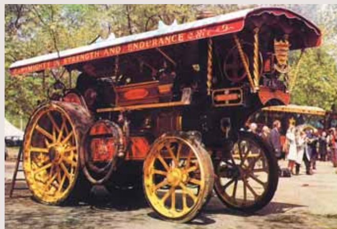
The Earl Kitchener