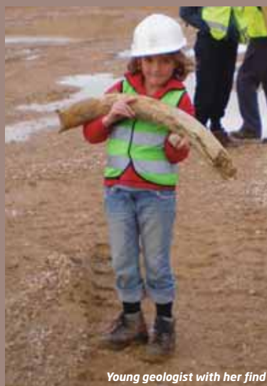
Young geologist with her find

Children and their parents from Rockwatch, the national geological club for children made its first visit to Shorncote Quarry in October 2009 where they were given the opportunity to prospect for Jurassic fossils about 160 million years old, or Ice Age fossils from a few thousands years ago. These budding geologists who are interested in rocks, fossils, minerals and the landscape were very excited at the prospect of finding some. Shorncote did not disappoint and provided one budding geologist with a large section of mammoth tusk from the deposits of Ice Age gravel. What a stunning find!