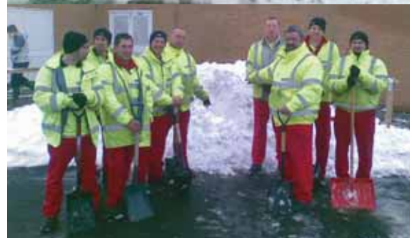
Hills staff clearing the snow at a local school and the resulting snow pile