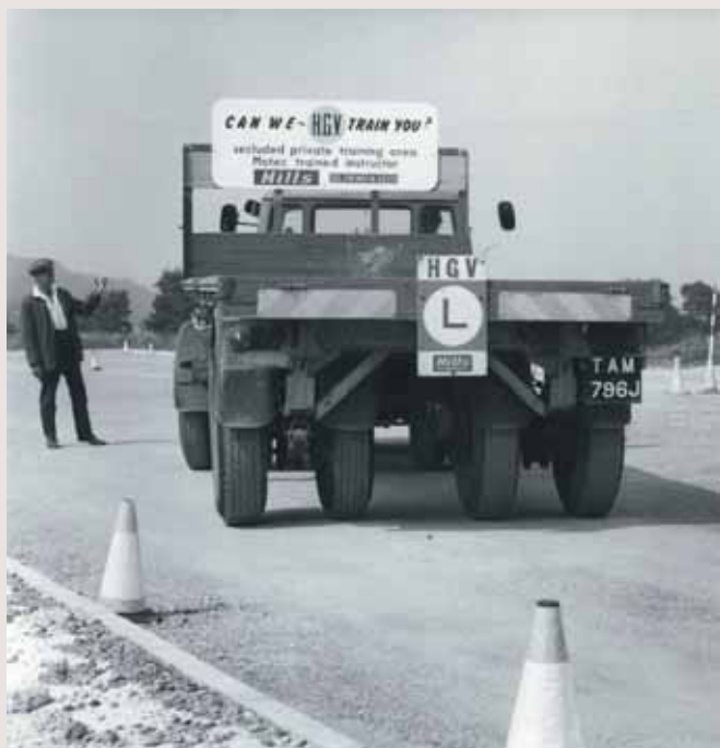
In the 1960s Hills offered a HGV training service at Badbury brickworks