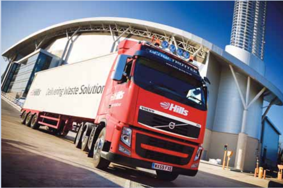
The future - Hills' new fuel efficient vehicle delivers waste to the Colnbrook Energy from Waste facility