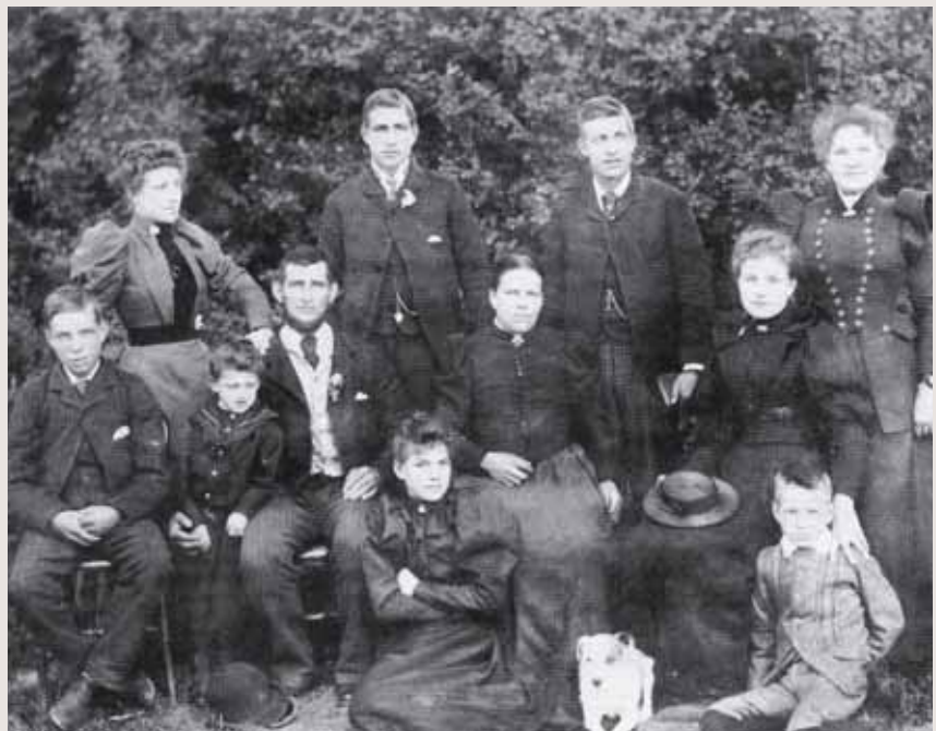
A Hills family portrait taken in the late 19th Century

The family connection to the business has always been strong but by no means exclusive. Non-family members have always been valued within the business, it is that astuteness which has kept the company afloat when other businesses have foundered on a desire to "keep it in the family".