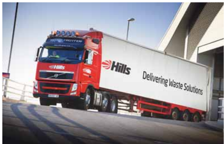
New Volvo FH500 at Lakeside EfW facility

Hills Waste Solutions has taken delivery of three new Volvo FH500 6x2 tractor units on five years contract hire. The new vehicles shuttle between Salisbury and the Lakeside energy from waste (EfW) facility at Colnbrook and replace the original FM440 6x4 units previously used to transfer the waste. All three vehicles are equipped with Volvo's Dynafleet Operate package which allows monitoring of fuel usage and vehicle location as well as driver management and fleet scheduling. These new vehicles will be more fuel efficient on road haulage operations like the Lakeside run and have already shown an 8% improvement on fuel consumption.