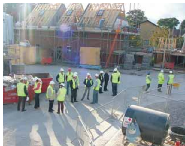
Shareholders and directors on site at Old Forge Close, Heytesbury

The shareholders thoroughly enjoyed the tour and were unanimous in their praise of the professionalism and enthusiasm of all management and the operational staff who had shown them around the sites.