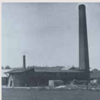
Chimneys at Purton

The Purton works was to become the main brickworks of the company. Edward had made an agreement with GWR for the use of rail sidings close to the claypit to speed the despatch of products. Other improvements to the site were made including larger furnaces and the construction of the landmark 100ft brick chimney.