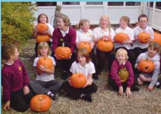
Schoolchildren with their pumpkins

Pumpkins, vegetables and sunflowers were plentiful in the gardens of St Dunstan's School after a donation of Warrior compost for their allotment garden.