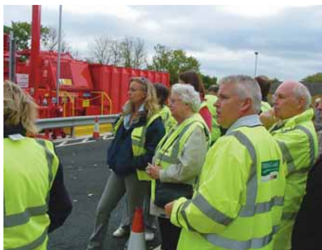
Shareholders at the new HRC in Warminster