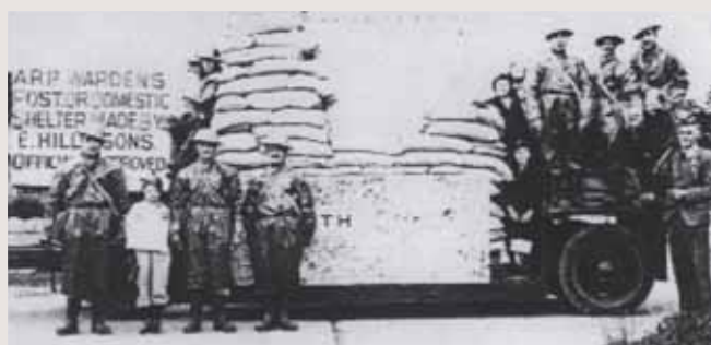
ARP men in Swindon with a display of household air raid shelters c1942. This shelter was erected by E Hill & Sons.