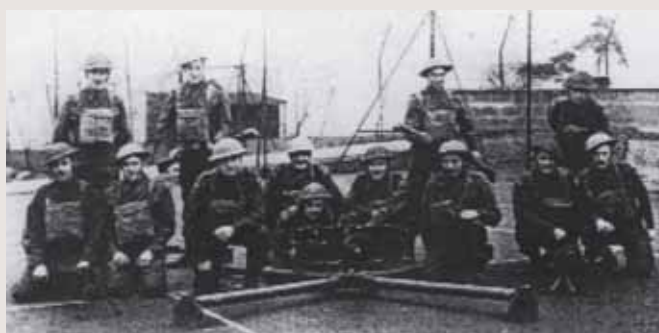
The Kingshill Home Guard

patriotism led to the donation of a £1,000 cheque from the company to the Swindon Spitfire Fund in September 1940.