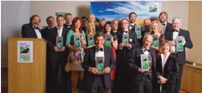
All the winners of the Corporate Green Awards with their plaques

Wiltshire Wildlife Trust's second Corporate Green Awards sponsored by the Hills Group were announced on Friday 16th October 2009 at a gala dinner hosted by BBC's It's Not Easy Being Green presenter Dick Strawbridge at the Four Pillars Cotswold Water Park Hotel.