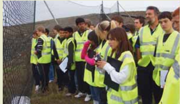
St Joseph's College students viewing the landfill site