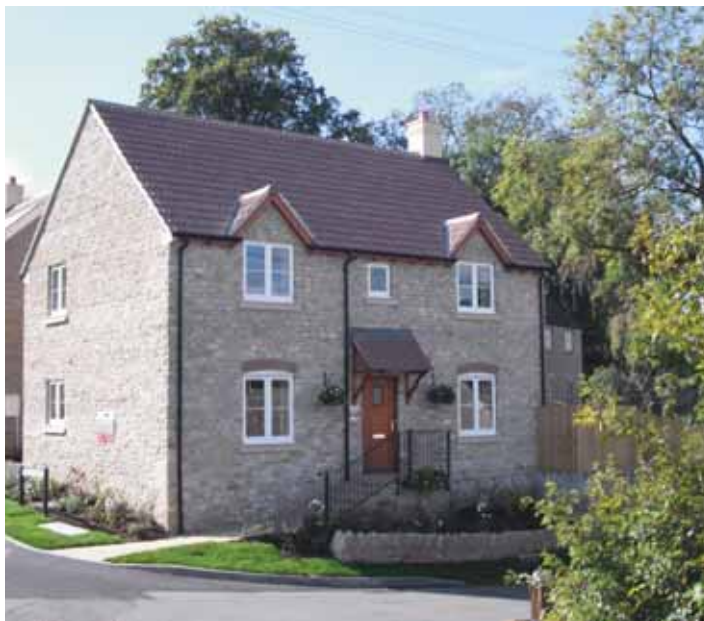
One of the natural stone homes for sale at Burton

The benefit of modern design in such a traditional setting has certainly proved popular. Hills Homes are renowned for building quality with a superb finish enhanced by such features as traditional dry stone walling and gardens. Homes are built incorporating existing greenery resulting in a development with a mature established setting.