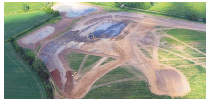
Low Lane Development

The sites are strategically important to the business and form a key part of Hills Waste Solutions' waste management process and hierarchy of waste disposal. There will always be a requirement for landfill and in order to provide this service as part of a wider waste collection, recycling, treatment and disposal portfolio, Hills Waste Solutions are preparing a landfill site at Low Lane to the north of Lower Compton. This new site, incorporating the latest operating techniques in compliance with EPR Regulations, will mean the impact on the environment of the site will be minimised. Though the future requirement of landfill is likely to reduce nationally, Hills Waste Solutions will continue to supply this important service in its core region.