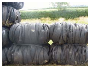
Baled tyres ready for shredding before applying to the landfill

Landfill construction is formed in cells with each cell required to have a full 'drainage blanket' to collect leachate (contaminated rain water) for removal and treatment. At Chapel Farm Hills we use recycled tyres to create drainage blankets as a substitute for aggregates.