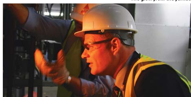
The glow from the furnace

The bottom ash generated by the incineration process is to be used as an aggregate.