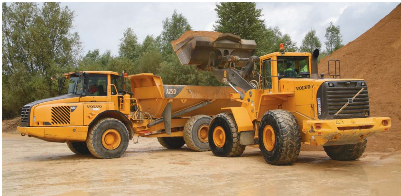
New Michelin tyres on site at Shorncliffe

Hills Quarry Products is seeing an increase in operating hours and fewer tyre related breakdowns after switching to Michelin's premium XHA and XADN tyres for its nine-strong quarry fleet.