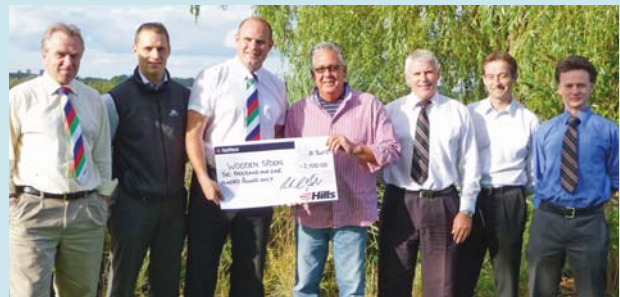
Cheque presentation to Wooden Spoon

Wooden Spoon is the charity of the rugby world that supports mentally, physically and socially disadvantaged children to help them achieve their full potential in life. The money raised will go specifically towards projects within Wiltshire.