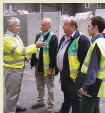
Aspire visit the MRF