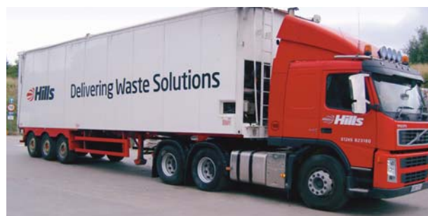
One of the lorries that delivers residual waste to Lakeside

Hills Waste Solutions' contract with Lakeside commenced in June to deliver 50,000 tonnes of residual waste a year. Delivery lorries pass over automated weighbridges using automatic vehicle recognition. The lorries tip the waste