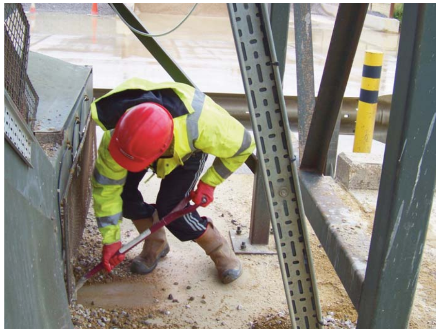
Health and Safety PPE Equipment on show whilst working in the concrete plant

Following these discussions and in conjunction with Hills' senior management team, HSAS developed a Health & Safety Management System that provides a consistent and structured approach to standards of health and safety throughout the Group. The new