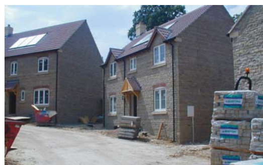
Homes are near completion at Burton

Superstructures in place and kitchens and bathrooms being installed, Church Rise in Burton, near Castle Combe is now well underway. The seven properties are being built using a mixture of stone and Bradstone, and will blend into the rural village set in a close incorporating established trees and planting. The five detached and two semi-detached homes are on target to be finished in the Autumn with