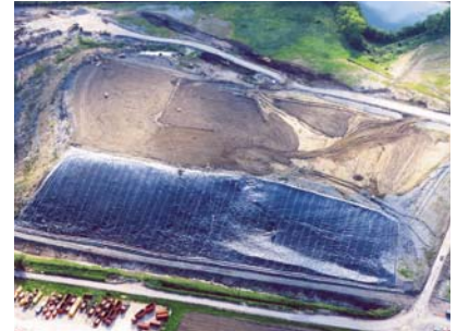
Aerial view of HDPE liner in place

by Hills Waste Solutions to maintain high operating standards. The ongoing management of leachate levels and gas are requirements of both the operational phase of the sites and post closure. Hills Waste Solutions work to ensure that the landfill site emissions are managed and their impact kept to a minimum. The cost for these works are funded out of the revenue the company generates from the sites whilst they are active.