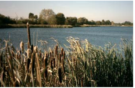
Restoration of Lake 1 completed Oct 03

Restoration of the former sand and gravel pit at Latton is near completion. The land and lakes will become an extension to the northeastern edge of the Cotswold Water Park and will form a willow carr (wet flooded woodland) and shallow water habitat for wading birds.