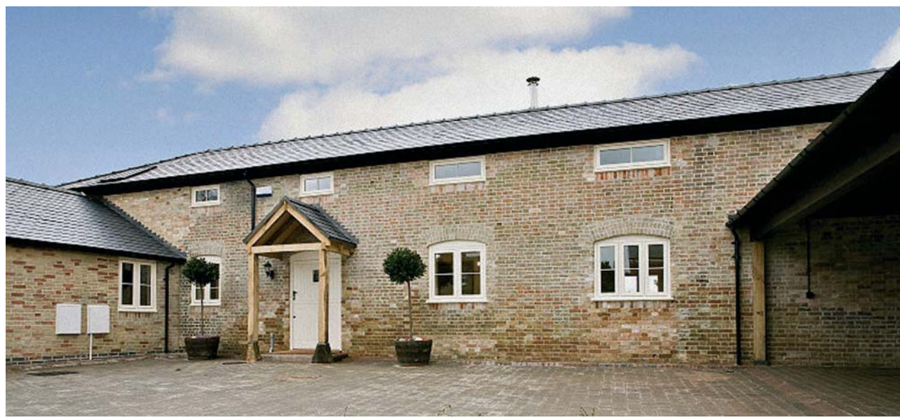
The Barn's front entrance