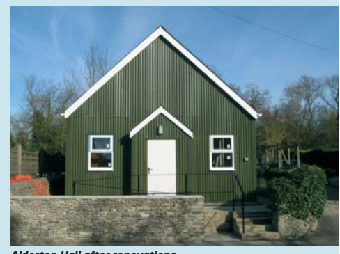
Alderton Hall after renovations