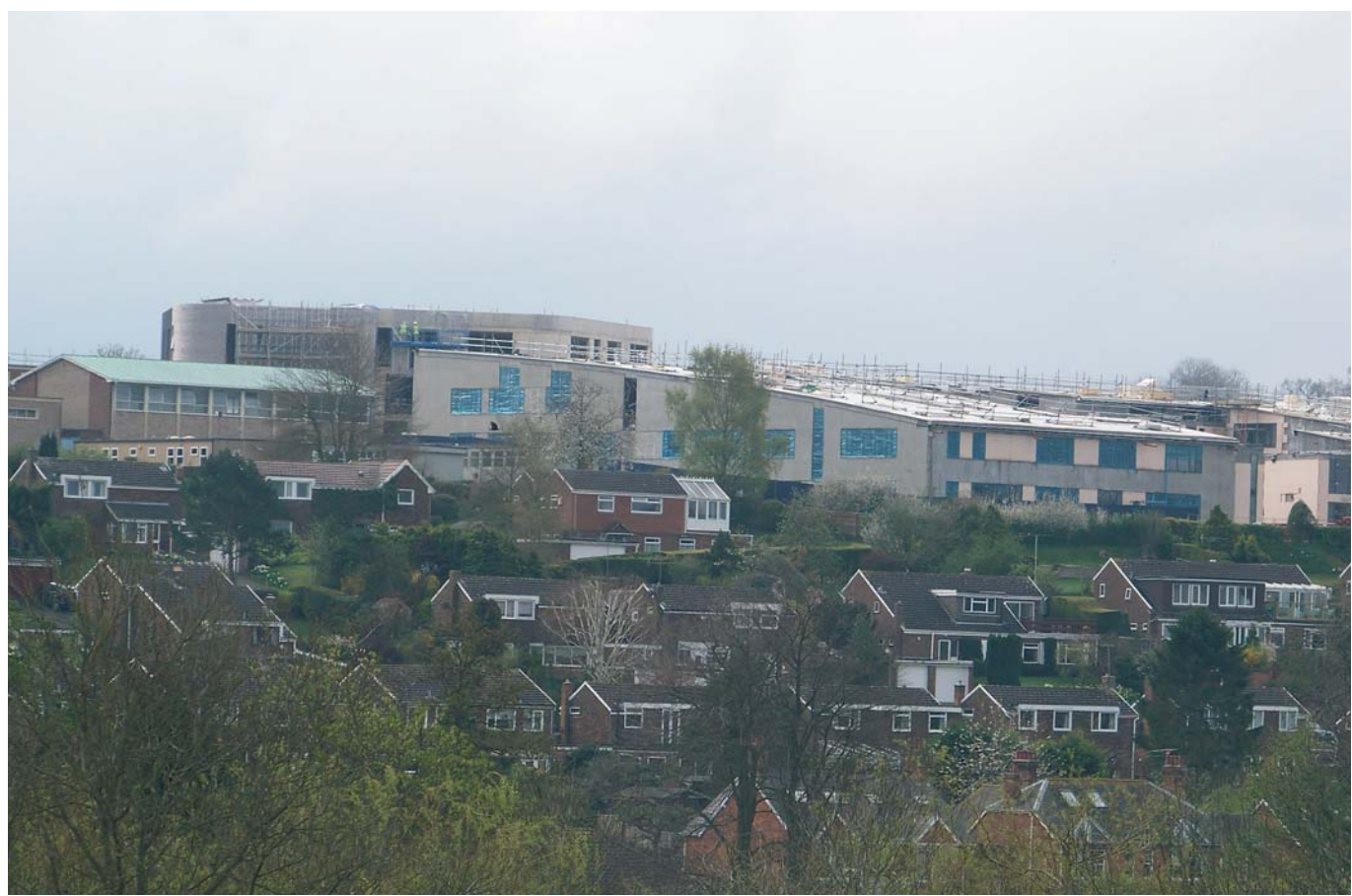
New St John's school being constructed on Marlborough's skyline