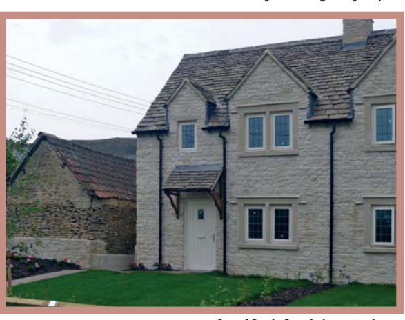
One of Castle Coombe's country homes