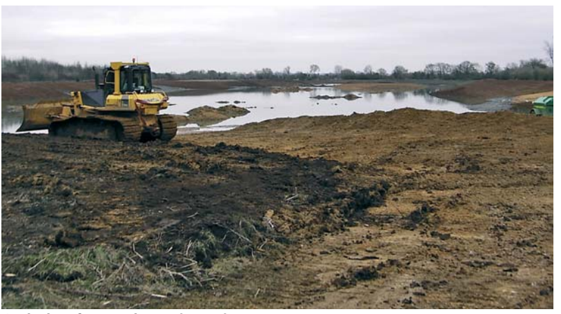
Beginning of restoration work on Lake 4