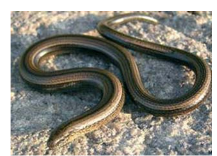
Slow Worm (Anguis fragilis)

Part of High Penn became home to a colony of 500 slow worms in June 2003 when they were relocated from a nearby Hills Homes development site. Hibernation mounds and heat traps were created for the slow worms, along with two ponds for frogs, toads and water living plants and creatures. This area is now well established and the slow worms are believed to have increased in number, reports are that grass snakes have also been seen in the area!