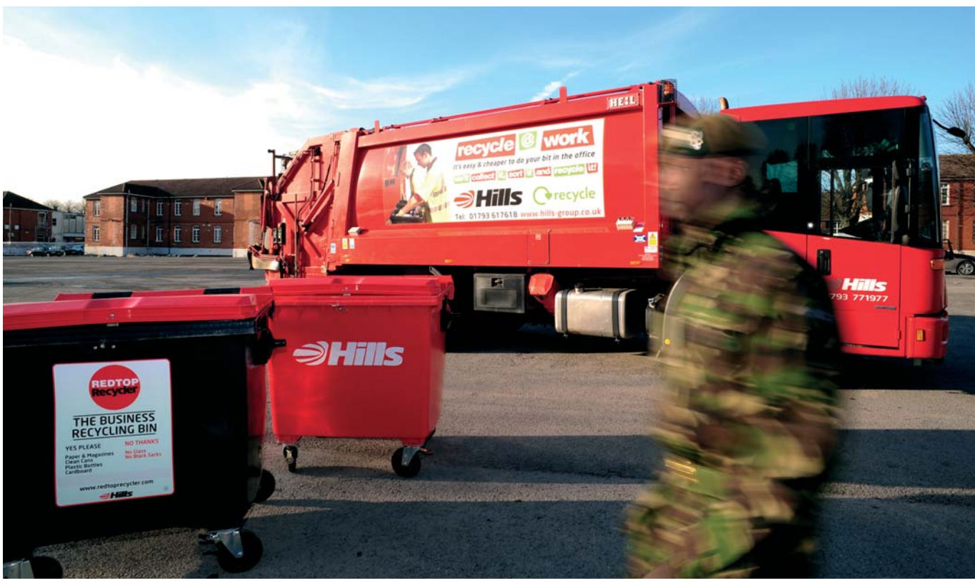
Hills on site at MoD garrison

for 35 years, and is being delivered by Aspire Defence, a joint venture between Carillion and KBR.