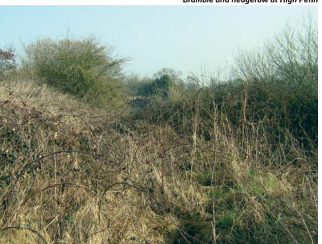
Bramble and hedgerow at High Penn

A variety of shrubs, wild flowers and trees, including Blackthorn, Oak, Ash, Lime, Black Poplar and Downy Birch will be planted together with a small amount of Norway Spruce and Scots Pine. This planting will provide a rich source of food for wildlife including insects and especially the Hairstreak butterflies which are nationally rare. The site will also include poles to support kestrel, buzzard and owls whilst still encouraging the likes of roe deer and badgers to the area.