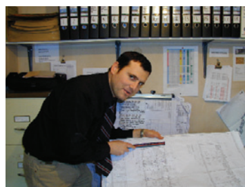
Getting to grips with the site drawings and....