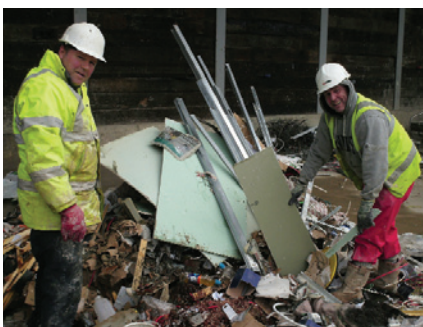
Still smiling - despite tough conditions on site