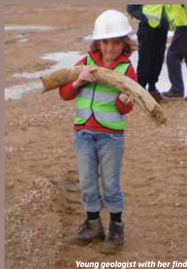
Young geologist with her find

Children and their parents from Rockwatch, the national geological club for children made its first visit to Shorncote Quarry in October 2009 where they were given the opportunity to prospect for Jurassic fossils about 160 million years old, or Ice Age fossils from a few thousands years ago. These budding geologists who are interested in rocks, fossils, minerals and the landscape were very excited at the prospect of finding some. Shorncote did not disappoint and provided one budding geologist with a large section of mammoth tusk from the deposits of Ice Age gravel. What a stunning find!