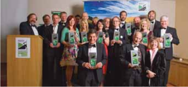
All the winners of the Corporate Green Awards with their plaques

Wiltshire Wildlife Trust's second Corporate Green Awards sponsored by the Hills Group were announced on Friday 16th October 2009 at a gala dinner hosted by BBC's It's Not Easy Being Green presenter Dick Strawbridge at the Four Pillars Cotswold Water Park Hotel.