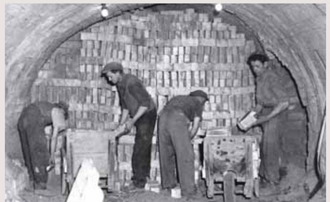
Stacking the continuous kiln at Purton