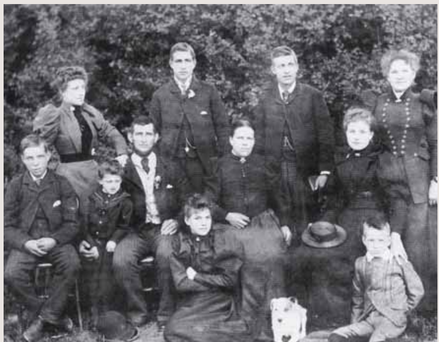
A Hills family portrait taken in the late 19th Century