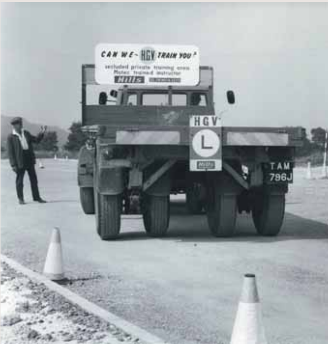
In the 1960s Hills offered a HGV training service at Badbury brickworks