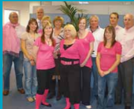
Pink ladies stand out at the Swindon Office

In addition to paying for the privilege of wearing an item of pink clothing, a cake sale and "guess the baby" competition were also held to raise funds.