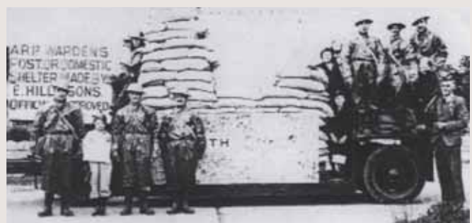
ARP men in Swindon with a display of household air raid shelters c1942. This shelter was erected by E Hill & Sons.

Harold was on active service with the Army in Europe. Their