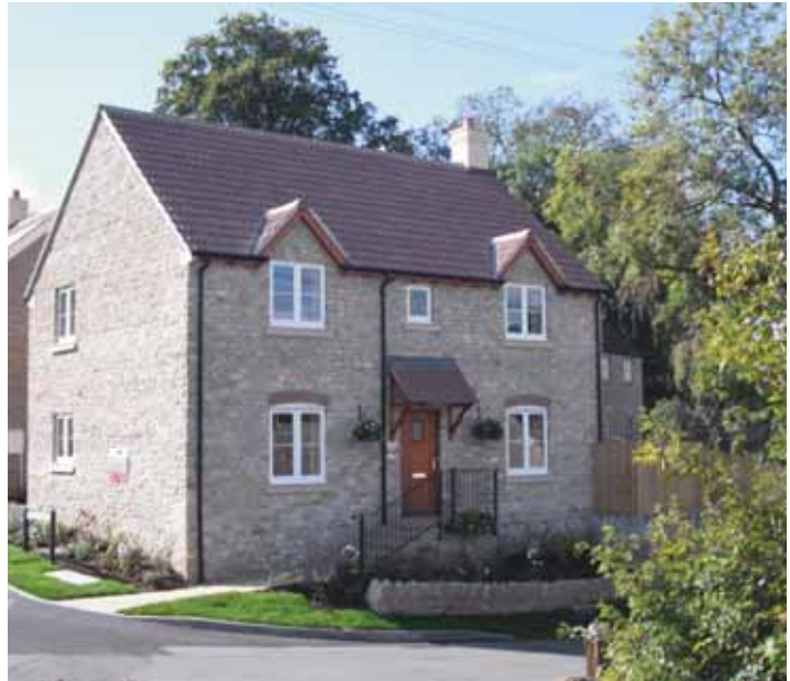
One of the natural stone homes for sale at Burton

The benefit of modern design in such a traditional setting has certainly proved popular. Hills Homes are renowned for building quality with a superb finish enhanced by such features as traditional dry stone walling and gardens. Homes are built incorporating existing greenery resulting in a development with a mature established setting.