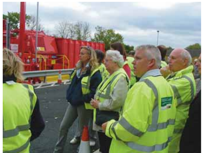
Shareholders at the new HRC in Warminster