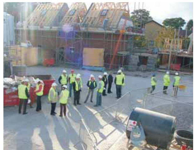
Shareholders and directors on site at Old Forge Close, Heytesbury

The shareholders thoroughly enjoyed the tour and were unanimous in their praise of the professionalism and enthusiasm of all management and the operational staff who had shown them around the sites.