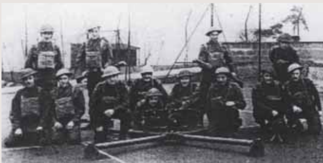
The Kingshill Home Guard

patriotism led to the donation of a £1,000 cheque from the company to the Swindon Spitfire Fund in September 1940.