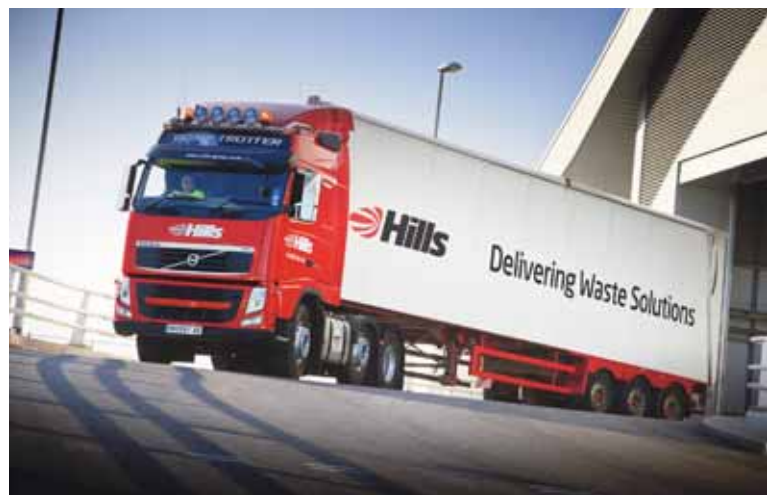
New Volvo FH500 at Lakeside EfW facility

Hills Waste Solutions has taken delivery of three new Volvo FH500 6x2 tractor units on five years contract hire. The new vehicles shuttle between Salisbury and the Lakeside energy from waste (EfW) facility at Colnbrook and replace the original FM440 6x4 units previously used to transfer the waste. All three vehicles are equipped with Volvo's Dynafleet Operate package which allows monitoring of fuel usage and vehicle location as well as driver management and fleet scheduling. These new vehicles will be more fuel efficient on road haulage operations like the Lakeside run and have already shown an 8% improvement on fuel consumption.