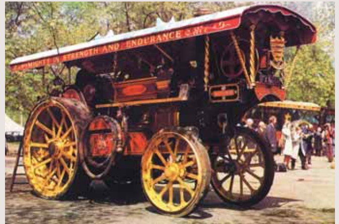
The Earl Kitchener