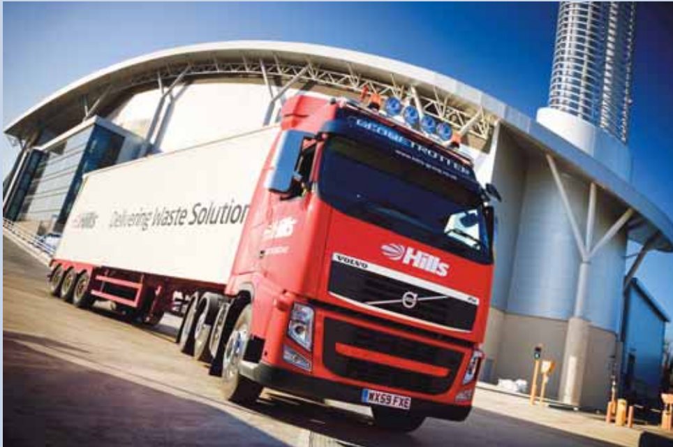
The future - Hills' new fuel efficient vehicle delivers waste to the Colnbrook Energy from Waste facility